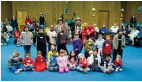
On Dec. 13, 2003, R.C. Buckner #1176 held its annual Christmas Party for patients of the Texas Scottish Rite Hospital for Children. More than 220 attended, including 23 patients and families. Clowns, magicians and The Momentum Dance Company entertained the kids followed by Saint Nick himself with goodies for every child attending.