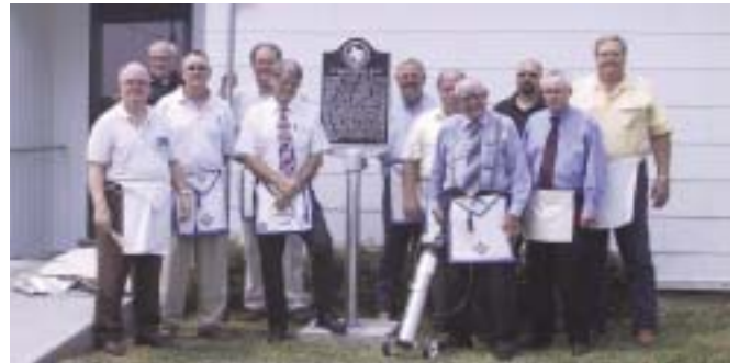
Alvarado Masonic Lodge #314 recently received an historical marker in recognition of its value to the community. Important is the fact that the marker is for the organization, and not the lodge building. A portion of the marker reads: "... From its earliest years it offered strong support of local education. The first lodge building provided classroom space, and the Lodge administered local school efforts, establishing the Masonic Institute in the 1870's. It later became Alvarado Normal Institute and then Alvarado High School. ... The Lodge continues to aid the community through its many programs."